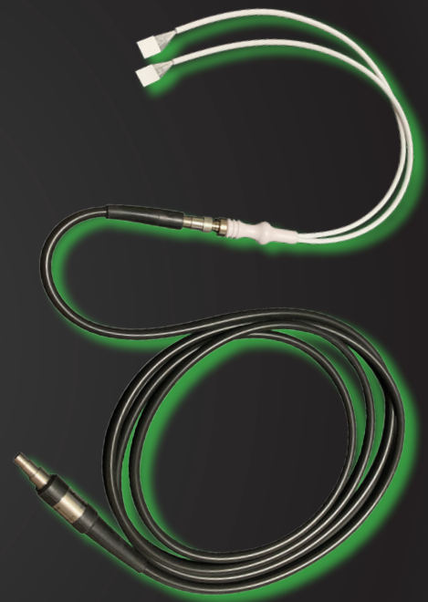
Connects to intermediate cable (10') - standard ACMI connection