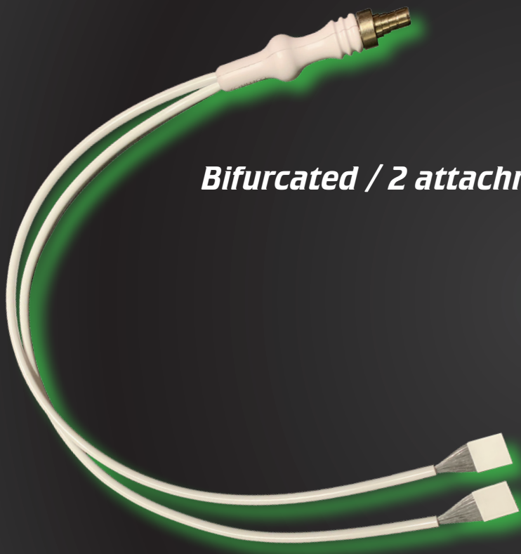
Bifurcated / 2 attachments