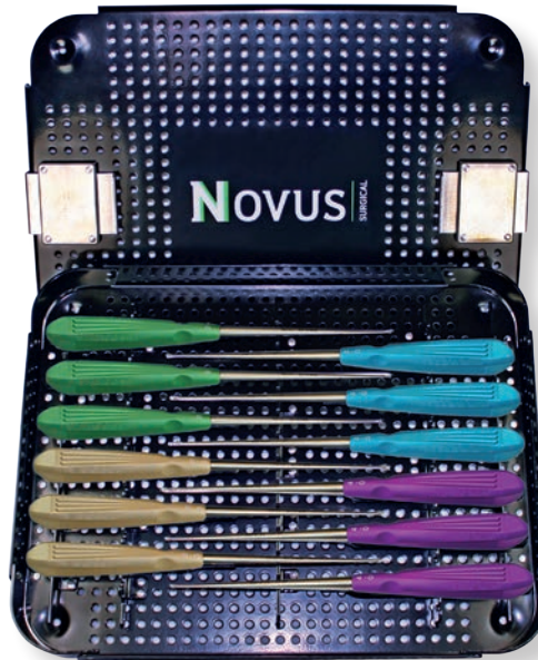
Rainbow Curette Set