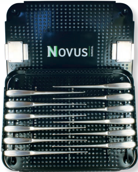
Bruns Curette Set