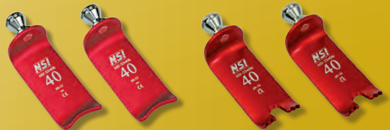
TL Blunt Blades 30mm - 65mm