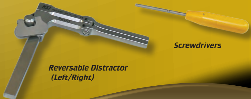
Reversible Distractor (Left/Right)