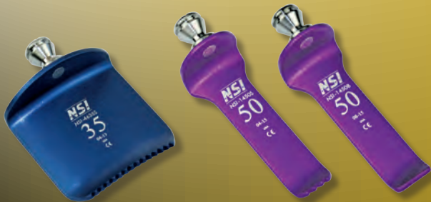
Multi-Level Blades 30mm - 65mm