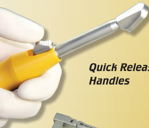
Quick Release Handles